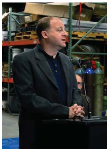
Congressman Polis at Fire Suppression Opening