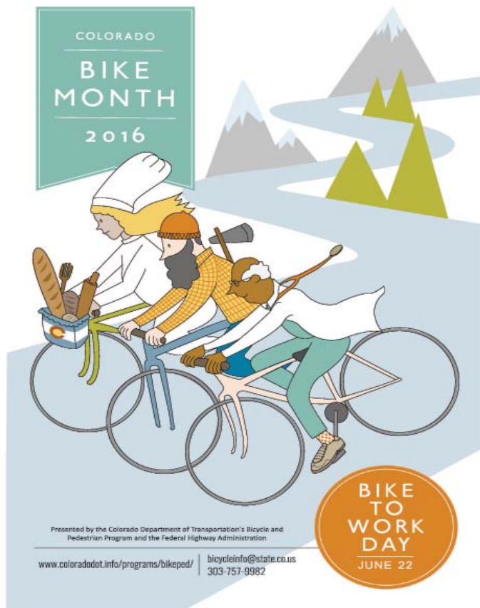
2016 Bike Month Poster

Congressman Jared Polis was instrumental in gaining federal support for the project. At the May 6 event the Congressman stated that "The Eisenhower Tunnel fire suppression system will improve the safety of travelers," Polis added, "It will help reduce the closure times in traffic. And most importantly, it will save lives."